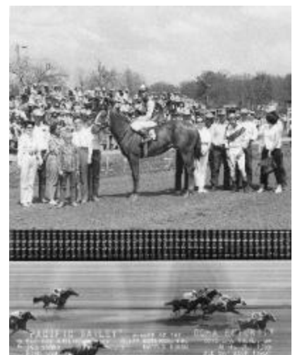
(right) Pac outrunning 3 horses that ended up qualifying for the All American Futurity in 1965.